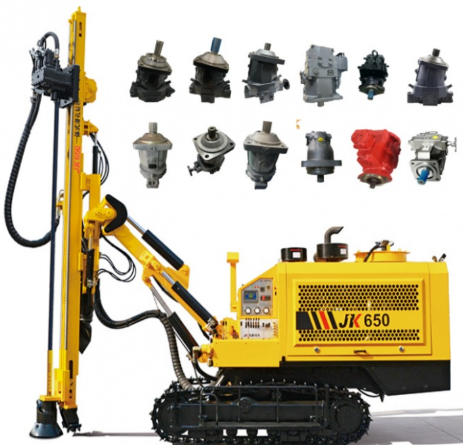
Axial-Piston Pump A11vo60drs/10r-Nsc12n00 Hydraulic Main Piston Pump