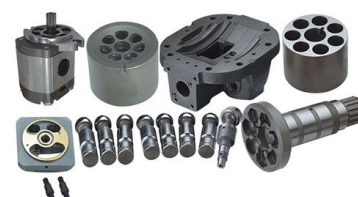
HITACHI HPV Series Pump Parts HPV145