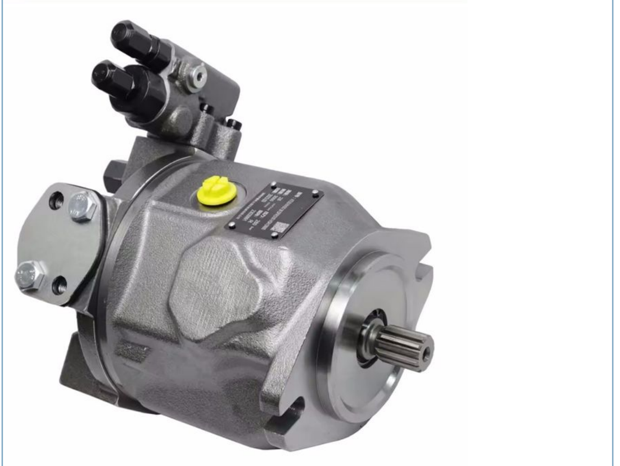
Axial Piston Variable Pump A10VSO

Variable pump in axial piston swashplate design for hydrostatic drives in an open circuit The flow is