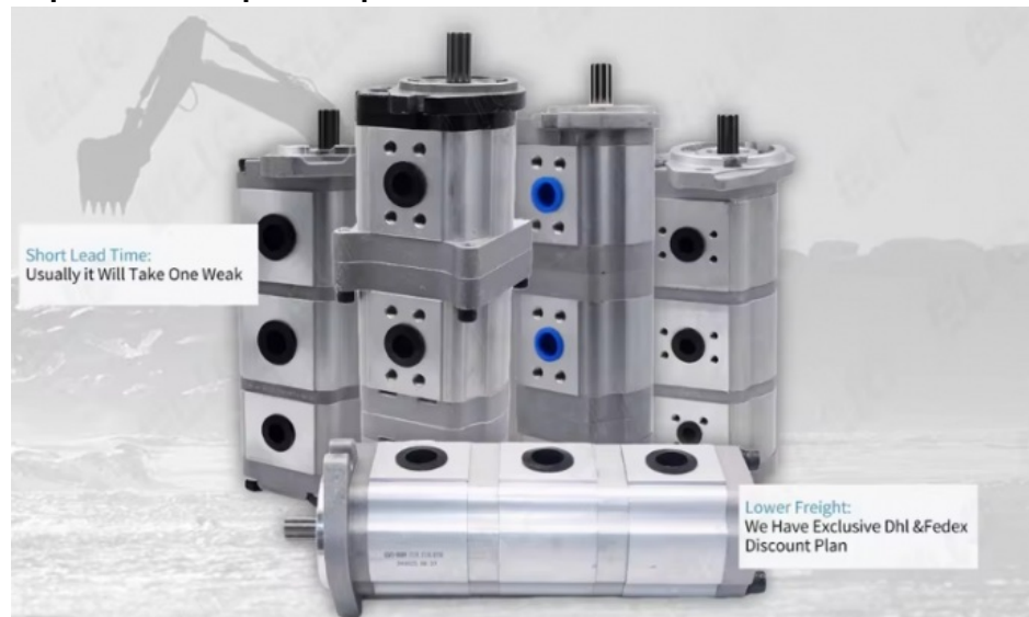
Gear pump Application Industry